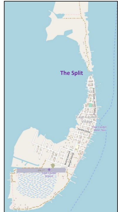
Caye Caulker (above) BEL team repairing generation equipment (below)

We apologize for the difficulties that this situation has caused and assure customers that we are doing everything we can to restore normal service to Caye Caulker as soon as possible. We will provide updates as developments take place.